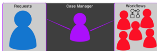
Figure 2: The case manager serves as a liaison between requesters, the workflows, and the units responsible for the work. Image by Patrick Rader (CC-BY-NC-ND).

The success of DCW was due, at least in part, to the cross-unit collaboration and knowledge sharing and building, and we will continue this in DCOT. The team is expanding to include new roles to perpetuate the transparency and processes established thus far, and to support the work of shepherding cases. In addition to case managers, we have recruited unit liaisons, who serve as unit representatives empowered to make decisions and report on unit capacities. These individuals are not necessarily in leadership or administrative roles, as we recruited people who are responsible for the work. In the event our current case managers are overwhelmed with work, we have also recruited a few supplemental case managers who will monitor projects as needed. Last, our cabinet sponsor will lead an assessment group to study the process from request to ingest to discover the patterns of requests, better understand problems, and develop solutions organically. While we did not hire any new personnel to fill these roles, many units have encouraged current employees interested in digital collection work to collaborate with us in light of this organizational need. So far, the response to the call for participation has exceeded expectations.